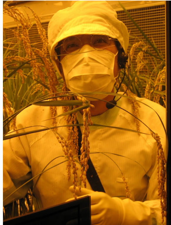
Figure 6. “Econaut” crew member of the Closed Ecological Experiment Facility (CEEF) team in Japan tending rice plants inside the facility (2007). Two Econauts and two miniature goats lived inside the facility for periods of up to 4 weeks, where full life support, including a near-complete diet was provided by plants. Notice the yellowish orange light from the high pressure sodium lamps used for crop light (photo taken by the author).

At about the same time as planning for NASA's BIO-Plex facility was taking place, Japanese researchers working with Dr. Keiji Nitta began development of the Closed Ecological Experiment Facility (CEEF) in Aomori Prefecture (Ashida and Nitta, 1995; Nitta et al., 2000) (Fig. 5). CEEF was part of the Institute for Environmental Sciences (IES) developed to track radio isotopes through closed ecosystems. When not in use for their primary studies, the facilities could be utilized for studies of controlled environment agriculture and human life support (Nitta et al., 2000; Tako et al., 2001, 2008; Tako, 2010). CEEF researchers designed complete diets from crops grown in 150 m 2 of the plant cultivation modules (Masuda et al., 2005; Tako et al., 2010.). Some areas used natural sunlight with supplemental electric lighting, while others only used electric lamps, such as high pressure sodium (Tako et al., 2010). Two-person crews lived inside the facility for 1-week, 2-week, or 4-week tests, eating foods grown inside the facility (Masuda et al., 2005; Tako et al., 2008, 2010). Rice, soybean and peanut were some of the major crops used for these studies (Fig. 6). In addition to the humans, two miniature goats were enclosed in the system and were fed inedible parts (leaves and stems) of the crops (Tako et al., 2008, 2010). Findings from CEEF documented