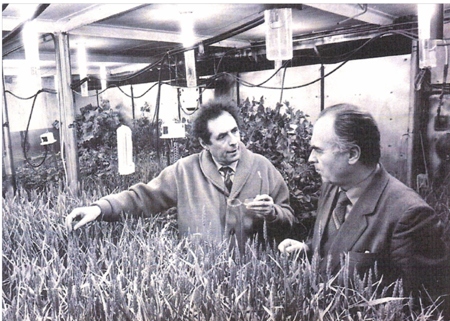
Figure 1. Academician Iosif (Joseph) Gitelson and Professor Genrich (Henry) Lisovsky inside BIOS-3 facility at the Institute of Biophysics in Krasnoyarsk, Siberia (ca. 1989). Gitelson and Lisovsky were two of the founding researchers behind Russian and worldwide research on bioregenerative life support systems. Note the vertically mounted, 6-kW water-cooled xenon lamps hanging from the ceiling. Crews of 3 people lived in the facility up to 4 to 6 months, during which the plants provided up to 70% of the food, 100% of O 2 , 100% of CO 2 scrubbing, and 100% of the water regeneration (photo and information courtesy of Joseph Gitelson, Advisor of Russian Academy of Sciences SB, with permission of Dr. Alexander Tikhomirov, Executive Director of Intl. Center for Closed Ecological System Studies, Institute of Biophysics).

Continuous lighting for each crop phytotron in BIOS-3 was provided by 20, water-cooled, 6-kW xenon lamps, which provided up to 1000 μmol m -2 s -1 of photosynthetically active radiation (PAR) at the plant level. For some tests, the number of lamps was doubled providing even higher light intensity. To my knowledge, these were some of first controlled environment agricultural systems to push