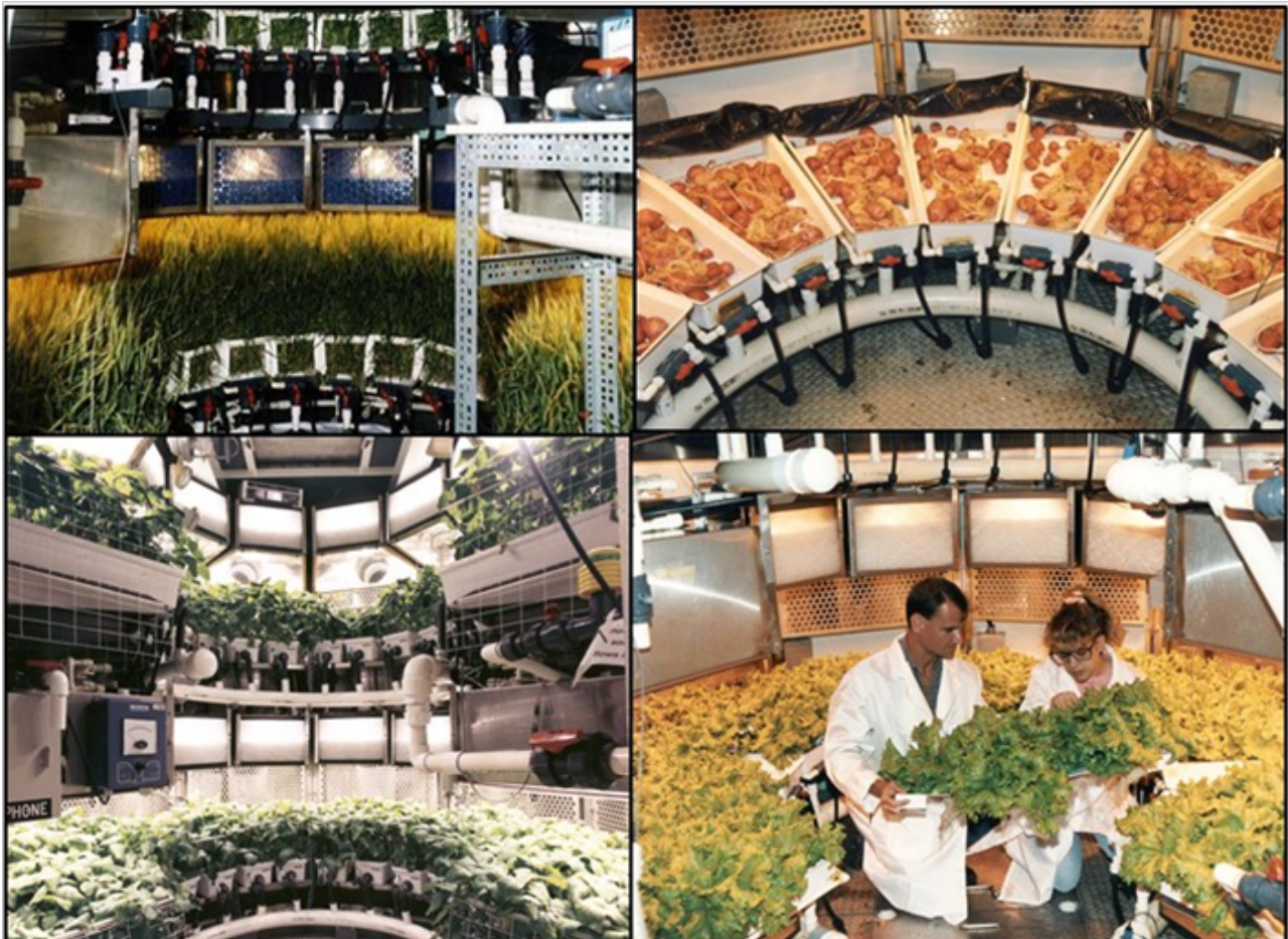
Figure 3. NASA’s Biomass Production Chamber (BPC), which operated from 1988 to 2000 at Kennedy Space Center, Florida. Crops tested included wheat (upper left), potato (upper right), lettuce (lower right), soybean (lower left), tomato, rice and radish (not shown). All crops were grown using hydroponics (nutrient film technique) with higher pressure sodium and or metal halide lamps. NASA’s BPC was one of the first working examples of a vertical agriculture system. KSC researchers Neil Yorio and Lisa Ruffe are shown in the lower right panel.

Most of the NASA sponsored ground-based testing with crops was carried out in smaller growth chambers (e.g., ~1-4 m 2 ) with little testing conducted on a larger scale, like BIOS-3. This led to the development of the Biomass Production Chamber (BPC) at NASA’s Kennedy Space Center, which operated from 1988-2000 (Prince and Knott, 1989). This was referred to as the Breadboard Project. The BPC provided 20 m 2 of growing area with a sealed atmosphere, similar to what might be encountered in space (Fig. 3). Plants in the BPC were grown hydroponically using nutrient film technique (NFT) on four shelves stacked vertically inside the 7.5 m high chamber. Unbeknownst to our group at the time, this was